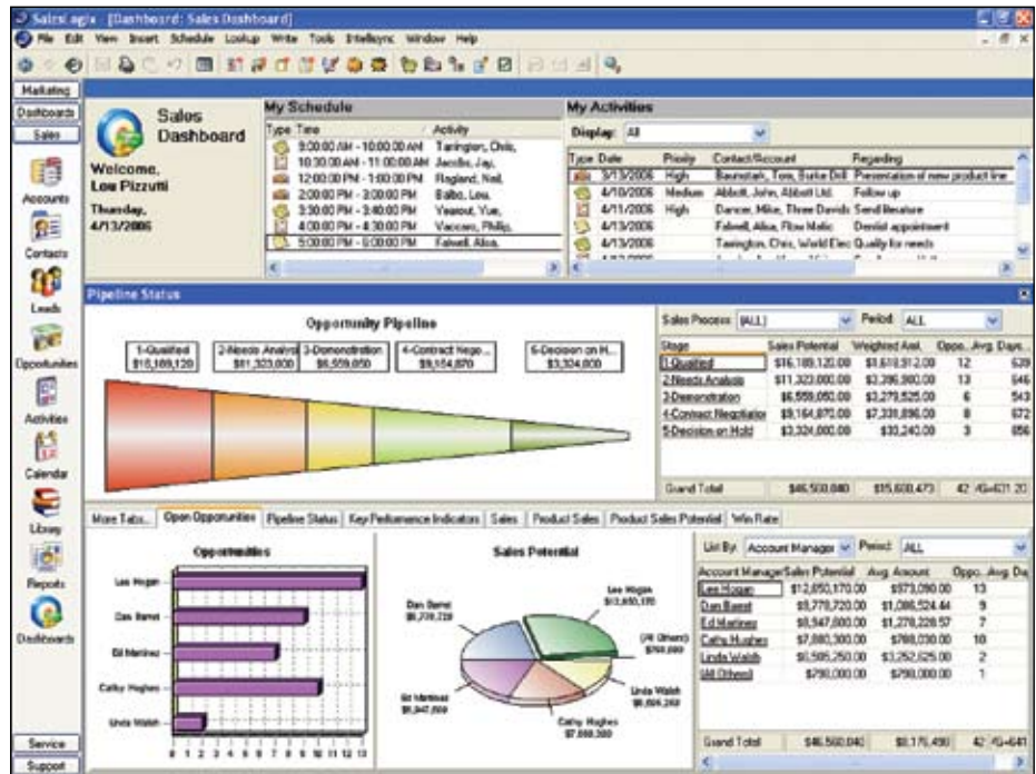
View performance metrics, diagnose key issues, and identify opportunities from a single location with Sage CRM SalesLogix Dashboards.